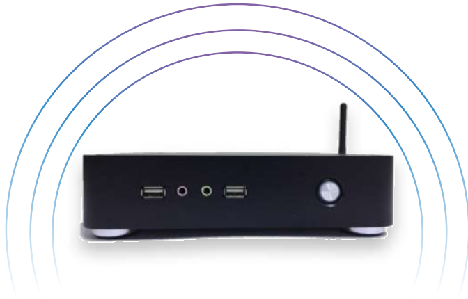
S4.2 & S8.4

Manage and control your electronic devices on your Meeting Room